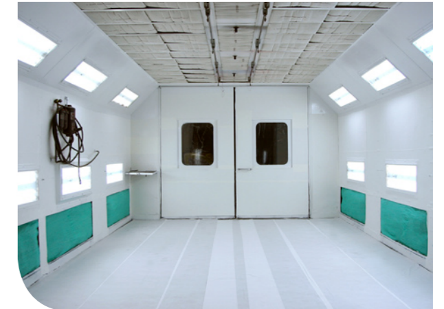
Paint Booth AFTER