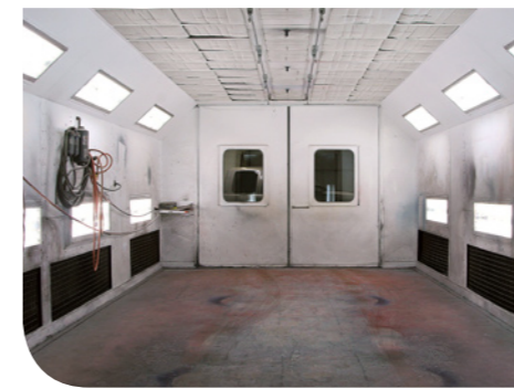
Paint Booth BEFORE